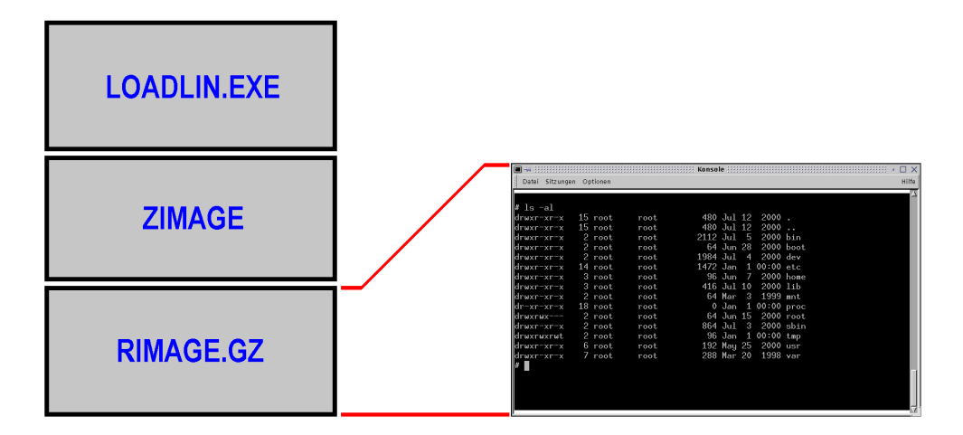
Figure 2: RIMAGE.GZ contains the complete root file system

In other words: After the boot-procedure the RAM-disk builds an exact copy of the files and directories in RIMAGE.GZ.